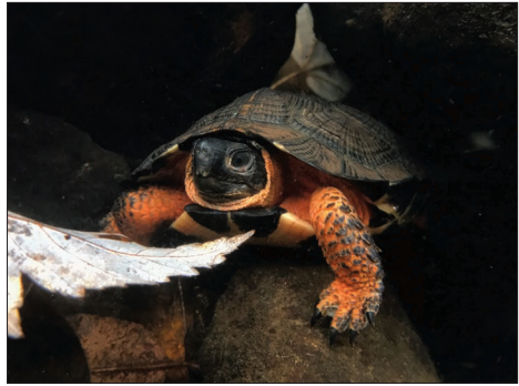
7.10—Wood Turtle survival probability follows a sigmoid function (i.e., S-curve), or a form of Type III survivorship, with survival probability increasing with body size as turtles grow and then reaching a plateau associated with size at maturity. Juvenile Wood Turtles are expected to exhibit survival rates lower than adults, but key size thresholds are not well established. A juvenile Wood Turtle is pictured in Massachusetts.

of both internal (lack of fertilization, genetic mutation) and external (climate, ant predation, mold growth, etc.) factors that may influence its survival. As is the case with most biological parameters, these rates are highly variable. Bob Hay (in Kapfer and Brown, in press) artificially incubated 1,792 eggs from 154 naturally laid clutches in Wisconsin and found that 369 (20.6%) of the eggs were infertile. In contrast, Walde et al. (2017) documented infertility for only 12 of 572 eggs (2.1%) in Québec. Tuttle and Carroll (1997) reported a hatching success of 77% for 70 eggs in New Hampshire, but did not determine if the unhatched eggs were fertile. Jones (2009) reported that the emergence rate of live hatchlings from the first observed and protected nest of 39 female Wood Turtles in Massachusetts and New Hampshire ranged from 0–1, with a mean of 0.41. In Virginia from 2010–2014, 75% of nests had some emergence of hatchlings, and like Massachusetts and New Hampshire, the proportion of hatchlings that emerged from non-depredated nests (i.e., protected) ranged from 0–1, with an average of 0.56 \pm 0.04 .