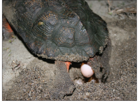
7.8—Generally, more than half of the mature female Wood Turtles in a given population will nest in any given year, but the proportion is spatiotemporally variable. Here, a Wood Turtle deposits an egg along a river in Massachusetts.