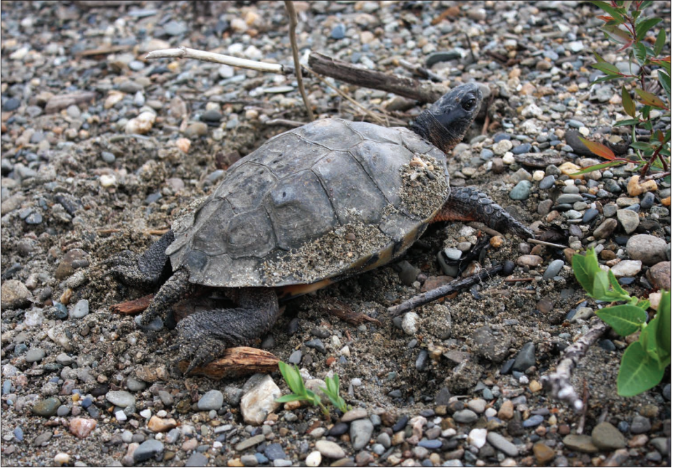
7.1— Like other emydine turtles, Wood Turtles generally exhibit late maturity and a long, iteroparous lifespan without reproductive senescence. Here, an old female Wood Turtle covers her nest in northern New England. MIKE JONES