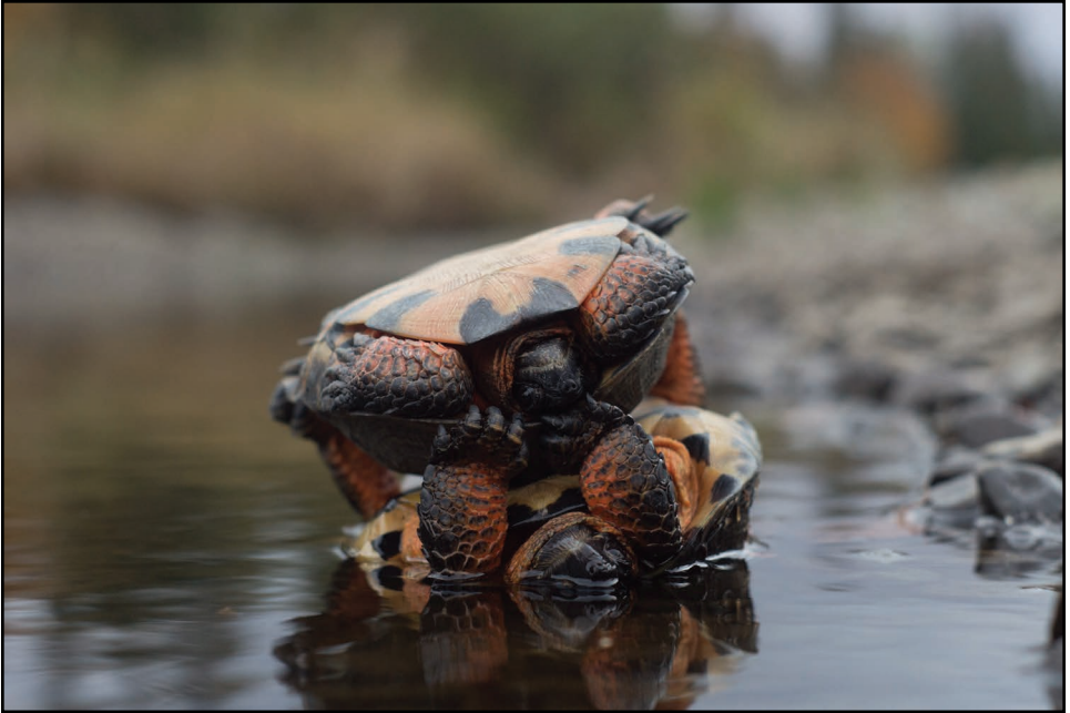
Courting Wood Turtles in a Maine stream.