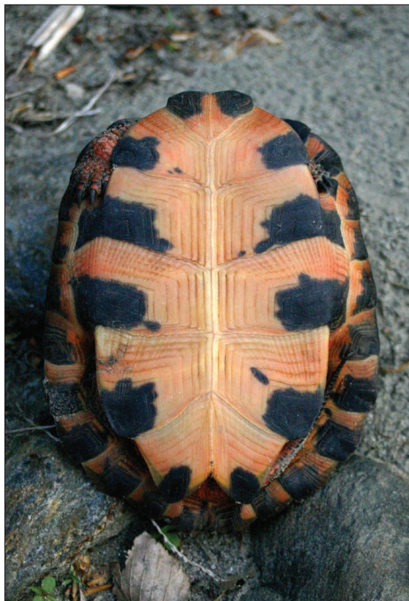
7.2—Age estimates produced by counting annular growth rings on the plastron is somewhat reliable only for immature or recently mature turtles, such as this (roughly) 9-year old female from Massachusetts. As a general rule, the count is more reflective of the animal's true age when there is clear evidence of new, medial growth, pictured here as a pale line down the plastral midline. Also, we assume a couple of years of error—even in age estimates for young turtles. MIKE JONES