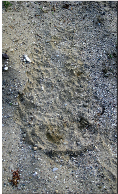
7.7— Like all turtle species, Wood Turtle eggs are fertilized internally by at least one male; the female deposits the eggs in the ground, and there is no known parental care after nest deposition. Tracks of a nest-searching female are shown in New England. MIKE JONES