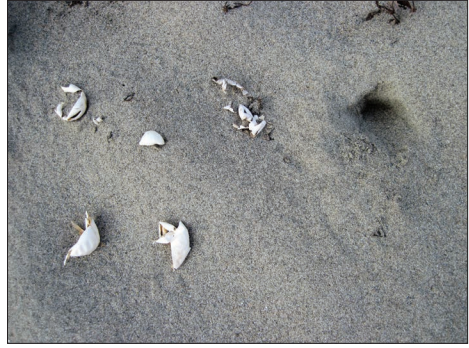
7.9—Depredation rates of Wood Turtle nests are spatially and temporally variable, but can result in very low egg survival rates. A New England Wood Turtle nest depredated in September—upon emergence—is pictured. MIKE JONES

Individual clutch size is positively correlated with carapace length (Brooks et al. 1992; Walde et al. 2007; Jones 2009). Average clutch size varies geographically, potentially in relation to geographic differences in average female size (Marchand et al. 2018). Distribution-wide, average clutch size ranges from 7–11 eggs (Table 7-1). In general, like adult body size, reported average clutch sizes are largest in northern populations and decrease in size to the south. The largest reported clutch size of 20 was reported from one of the northernmost populations in Québec by Walde (1998) and Walde and Saumure (2008).