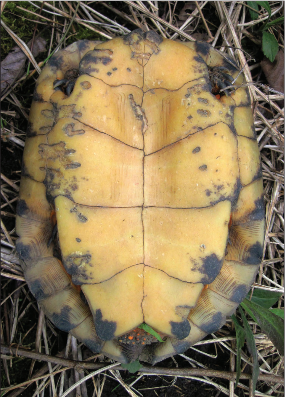
7.5—Depigmentation of the plastral scutes may also be influenced and accelerated by injuries that either penetrate the keratin layer ( left ) or limb loss that results in localized wear on the affected side ( right ). In the righthand image, note the turtle's missing hind right foot and the corresponding reduction in pigment on the proximal scutes. Two different males are pictured. MIKE JONES