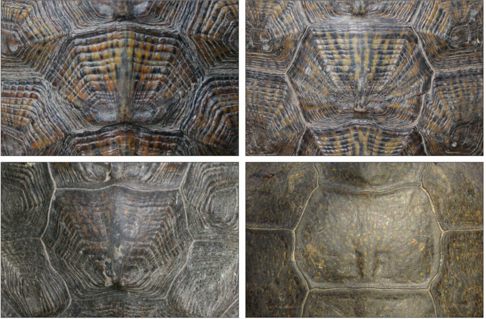
7.3—A study in New England estimated the Wood Turtles' carapace scutes may require approximately 80 years to become completely worn, based on time-lapse (interval) photographs of 75 individuals. Here, four wear classes are shown from left to right, top to bottom, with the least-worn at top left. These figures correspond to the four wear classes utilized in the analysis by Jones (2009). MIKE JONES