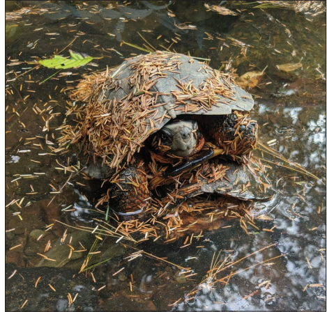
7.11—Wood Turtles’ iteroparous life history is dependent on continuous high adult survival for population viability. Courting Wood Turtles are pictured in a conifer forest in New Brunswick, covered in needles of spruce ( Picea spp.) and Balsam Fir ( Abies balsamea ). DAMIEN MULLIN

Based on occurrence records and recent surveys, Jones et al. (2015) estimated 58% of suitable habitat in the northeastern U.S. has been impaired as a result of land use conversion. In central Massachusetts, Jones (2009) reported that most populations appeared to be declining and presented limited evidence of significant declines at three study sites over periods of up to 5 years. Jones and Sievert (2008) presented evidence that Wood Turtles in western Massachusetts were declining by as much as 11.2% annually, and among other threats, they were negatively affected by severe floods, which apparently caused population declines in northwestern Massachusetts. Jones (2010) noted that Wood Turtles have become very rare inside the Interstate 95 corridor near Boston. Elsewhere in Massachusetts, in Concord, Middlesex County, Henry Thoreau observed Wood Turtles to be common in the late 1850s, and Rickettson (1911) reported them to be “common in the brooks” in the early 20 th century, but Greer et al. (1973) reported Wood Turtles to be “infrequent” by the 1970s. Further, Windmillier and Walton (1992), Windmillier (2009), and Cook et al. (2011) reported that the Wood Turtle had declined nearly to extirpation in Concord, although approximately five individuals have been observed in that town since the