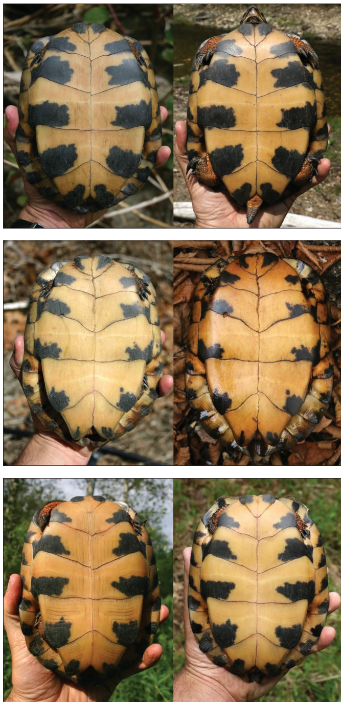
7.6—Pictured here are time-lapsed photos of six New England Wood Turtles taken more than a decade apart, with the original photograph on the left and the most recent photograph at right. Six pairs of images are shown of six different turtles; each pair of images show the same turtle. Three female Wood Turtles pictured at left (from top to bottom) were photographed in 2005 and 2018, 2006 and 2019, and 2006 and 2018, respectively. Three male Wood Turtles pictured at right (from top to bottom) were photographed in 2006 and 2016, 2004 and 2019, and 2005 and 2015, respectively. MIKE JONES