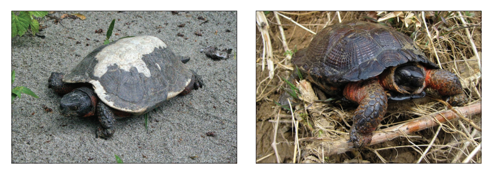
8.15—Floods during the winter inactivity season may directly displace or entomb dormant Wood Turtles. Displaced Wood Turtles may suffer limb or shell injuries, as pictured on this flood-displaced Massachusetts male ( left ). Wood Turtles may also be lethally entombed by rapid deposition of flood debris or by massive bank collapse, which trapped this Virginia female ( right ).

Depending on the seasonal activity level of Wood Turtles at the time of the flood event, floods may directly entomb turtles through rapid deposition of sediment and debris, or displace them downstream (8.15). Severe floods may displace individual Wood Turtles from resting places within the stream channel, resulting in drowning or injury (Sweeten 2008; Jones and Sievert 2009). In a study of a western Massachusetts sream system, Jones and Sievert (2009) observed 17 displacements of 12 turtles ranging from 1.4 to 16.8 km during large floods, and they reported elevated mortality rates and depressed reproductive rates in flood-displaced animals. The smallest flood resulting in displacement observed in this study was approximately 14.5 times the average daily flow, or 24.4 m<sup>3</sup>/s, although flows exceeding 248.0 m<sup>3</sup>/s were observed. Disruptive floods in this system occurred at a rate of 1.7 per year during the study (2004–2008), higher than the