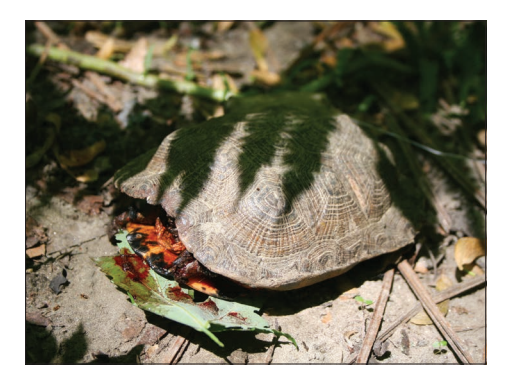
8.20—Most mesopredator depredation is probably caused by Raccoons ( Procyon lotor ), but American Mink ( Mustela vison ) and North American River Otter ( Lontra canadensis ) are also likely mammalian predators of Wood Turtles. Sometimes, various threats can act synergistically— to lethal effect. Here, an adult female is pictured on a New England river beach after being attacked by a mink or otter. The predator removed all of the turtle's limbs and most of its face after it was displaced by a major flood in 2007. MIKE JONES

Predation of adult Wood Turtles by corvids (primarily American Crows and Common Ravens) appears to vary by site and region, and in some locations is a major conservation concern and warrants consideration in