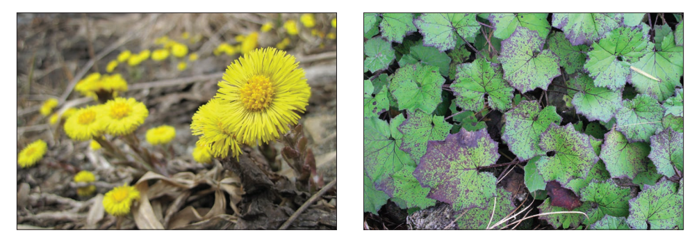
8.6—Coltsfoot ( Tussilago farfara ), shown here in its flowering and vegetative stages, is a Eurasian species now commonly found in Wood Turtle habitats range-wide. Although it is widespread, there is no evidence to suggest that Coltsfoot negatively influences the function of Wood Turtle habitat.

(Akre and Ernst 2006). At Great Swamp National Wildlife Refuge in New Jersey, Wood Turtle nesting areas are also negatively affected by Common Mugwort ( Artemisia vulgaris ) (Buhlmann and Osborn 2011). Wood Turtles actually feed upon some invasive plant species including Autumn Olive berries (Kleopfer, unpubl. data.) in Virginia and Japanese Knotweed, Reed Canary Grass ( Phalaris arundinacea ), and Bishop's Goutweed ( Aegopodium podagraria ) in Massachusetts (Jones and Sievert 2009b).