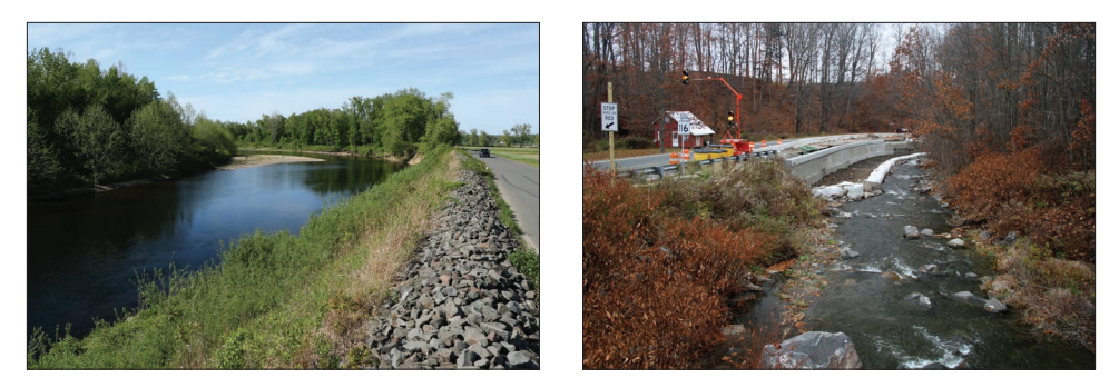
8.7—Bank stabilization or hardening is a common practice to minimize loss of residential or agricultural property caused by streambank erosion. Often, bank stabilization reduces the quality of bank and riparian habitat for Wood Turtles. Large, hardened structures can also influence downstream deposition patterns and can result in direct mortality of turtles during construction. Some rivers are heavily influenced by centuries of bank stabilization efforts, such as these sites in Massachusetts. MIKE JONES