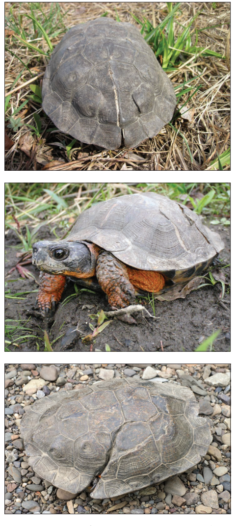
8.4—Active-season forestry operations can result in significant mortality or injury to Wood Turtles. Wood Turtles with serious shell fractures are regularly observed in remote areas of managed forestland. These older female Wood Turtles were found in relatively remote areas of New England forestland with severe—but healed—carapace fractures that were likely caused by forestry operations, forestry-associated vehicles, or mowing. DEREK YORKS & LIZ WILLEY

Some carefully planned riparian forestry practices (e.g., smaller harvest openings and