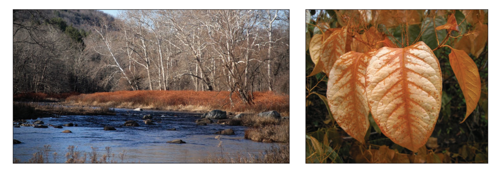
8.5—Japanese Knotweed ( Reynoutria [= Fallopia ] japonica )—appearing here as an orange understory shrub layer in a floodplain forest of American Sycamore ( Platanus occidentalis ) in Massachusetts ( left ), and along stream banks elsewhere in New England ( right )—is probably the most ecologically problematic invasive plant species affecting Wood Turtle populations. Dense and established knotweed populations can impair the function of Wood Turtle nesting beaches. MIKE JONES

(Jones, Yorks, and Willey, unpubl. data) (8.4). In addition, the elimination of a forested stream buffer due to timber harvesting can result in increased stream bank erosion, water quality and flow degradation, and reduced in-stream habitat heterogeneity from fallen trees and other riparian organic inputs (Akre and Ernst 2006; Tingley and Herman 2008). Structured or experimental research into the response of Wood Turtle populations to various forestry practices, including prescribed fire, is warranted.