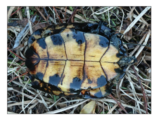
8.16—Increasing anecdotal evidence suggests that prolonged droughts, which affect perennial streamflows, can subject Wood Turtles to elevated rates of depredation by mesopredators. This mature female was killed by an otter or mink during a prolonged drought in Concord, Middlesex County, Massachusetts—where the Wood Turtle has been functionally extirpated. MIKE JONES

Sweeten (2008) observed likely flood displacement of three (of 36) adult Wood Turtles in November 2006 at a site in northwestern Virginia. Two males were displaced 13.6 and 19.8 km into the main stem of a larger river downstream, and one female was displaced 1 km. The author speculated that the displacement occurred because the turtles had returned to the river but had not yet "embedded" themselves for the winter in the rootmasses or undercut banks. Both males subsequently made large upstream movements; neither returned to their original capture location within one year.