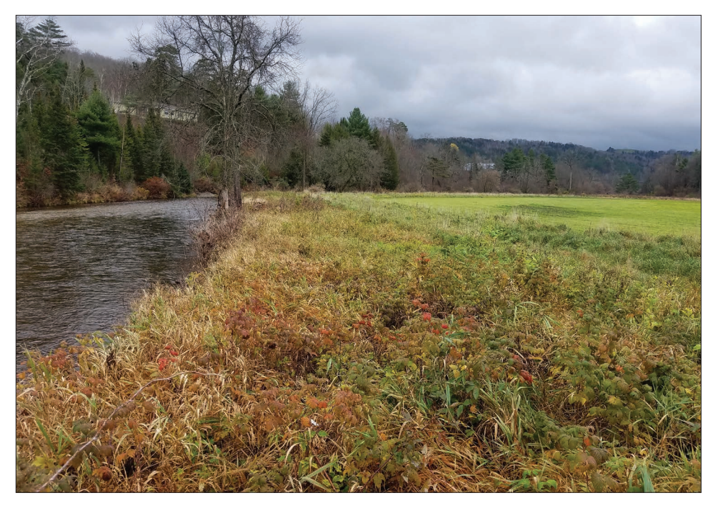
8.1—Floodplain ecosystems preferred by Wood Turtles have historically provided rich soils for agriculture, clearly illustrated at this site in New England. KILEY BRIGGS