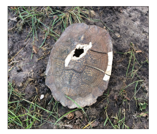
8.11—Wood Turtles are occasionally shot from their basking sites, as was this female in Iowa.

In recent decades, illegal collection for domestic and foreign pet markets has become a major, unpredictable, regrettable threat (Compton 1999; NatureServe 2013). While the corrected, real price of Wood Turtles in the early 1960s was about $20.00, the price charged on online markets has climbed to more than $900 per turtle as of this writing.<sup>4</sup> The more than 45-fold increase likely reflects a decline in abundance (and availability).<sup>5</sup> Large-scale collection has been documented in