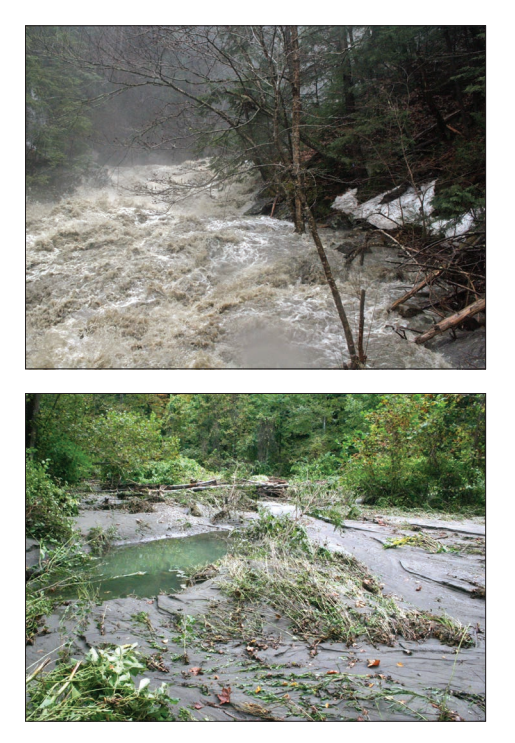
8.13—Severe flooding—especially floods in mountainous terrain resulting from spring rain on a heavy snowpack ( top )—may alter or disrupt channel geomorphology, damage floodplain vegetation, and redistribute sand and gravel deposits used for nesting ( bottom ).

magnitude, and seasonality. For example, floods may alter or rearrange channel geomorphology, damage floodplain vegetation, rearrange woody structure in the stream channel, or redistribute sand, gravel, and other sediments (Compton 1999), which in turn may either augment or decrease the available nesting habitat (8.13).