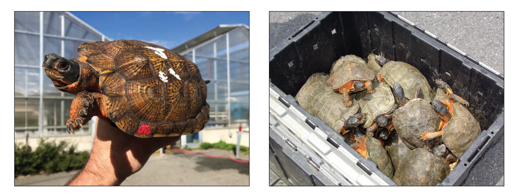
8.10—Wood Turtles have been collected variously for food, scientific and museum collections, biological supply, and—more recently—as high-end pets. Today, Wood Turtles continue to be collected to satisfy a burgeoning, illegal international market in North American turtles, undermining efforts to protect and conserve otherwise functional populations. Until there is a more coordinated federal approach to regulate interstate and international trade in this species in the United States, many important wild Wood Turtle populations will remain at risk. The Wood Turtles pictured here were confiscated by wildlife agencies, and they represent populations throughout the eastern part of their range. JOHN D. KLEOPFER & MIKE JONES

houses became a major detrimental cause of Wood Turtle population collapse (Vogt 1981), reflecting a trend that probably extends back several decades earlier (Jones et al. 2015).