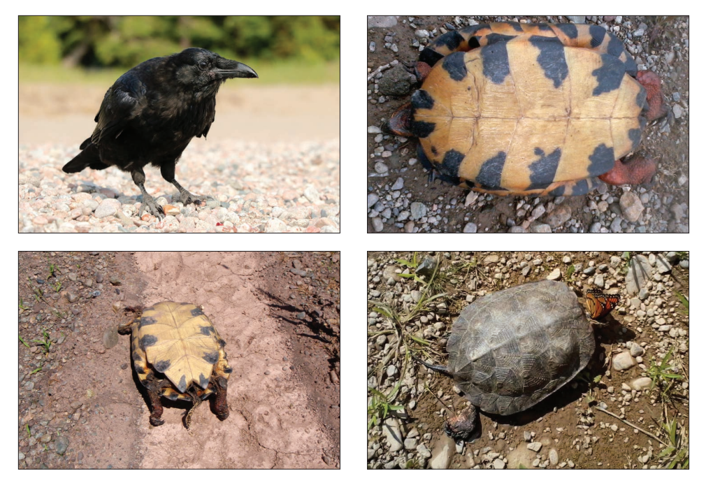
8.21—Predation of adult Wood Turtles by corvids appears to vary by site and region, but in some locations is a major conservation concern. Corvid depredation warrants consideration in management planning and additional targeted research. An adult Common Raven ( Corvus corax ) from Ontario is pictured ( top ), along with several adult Wood Turtles depredated by Ravens in New Brunswick ( bottom ).

management planning. In New Brunswick, McCullum (2016) observed over 48 mortalities attributed to depredation by Ravens. More than 60 dead Wood Turtles were found at two nearby sites, attributed to the same cause (8.21). Marchand (2019) observed American Crows killing adult Painted Turtles ( Chrysemys picta ) in New Hampshire.