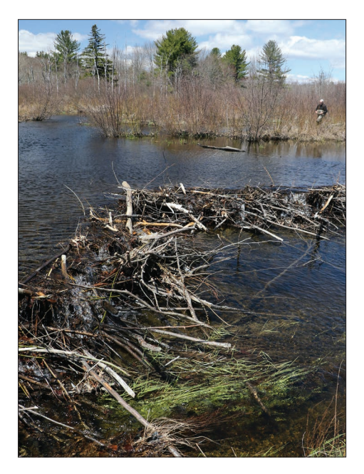
8.9—Beavers create mosaics of successional wetland communities by building and maintaining dams. Prior to their extirpation from many areas of eastern North America, beavers were undoubtedly a significant driver of vegetation dynamics within Wood Turtle river systems. A beaver-impounded Wood Turtle stream in New England is pictured.

Today—especially within heavily fragmented or isolated Wood Turtle sites beaver dam construction more often degrades site quality for Wood Turtles. Without adequate riparian connectivity to other areas