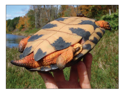
8.18—Adult Wood Turtles are able to survive mesopredator attacks under some conditions, as evidenced by frequent (but highly variable) rates of limb loss in populations throughout their range. This female Wood Turtle in Massachusetts has survived and nested for at least fifteen years with a missing hind foot—which, for a Wood Turtle, is an extremely minor injury.