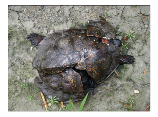
8.2—Road mortality of adult, juvenile, and hatchling Wood Turtles is a major threat to the species throughout its range. This adult male was killed along a state highway that closely parallels what must formerly have been an exceptional Wood Turtle river in central New England. MIKE JONES

New Jersey, nearly 10% of validated Wood Turtle occurrence points are live and dead on-road observations (NatureServe 2021). Further, where roads serve as attractive areas for egg-laying, as on the George Washington National Forest of northwestern Virginia, the roadside nesting sites themselves may function as ecological traps (Akre 2010). Heavily trafficked forest management roads in otherwise remote landscapes can also be potentially hazardous features, where few other anthropogenic threats are present. Newly created forest roads can also open otherwise unfragmented habitat, allowing poachers and collectors to access sites more readily. In recent years, as abandoned railway lines have been