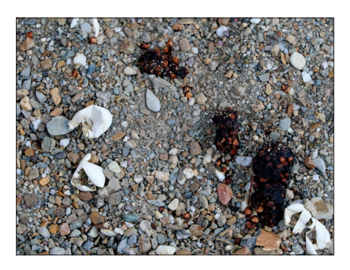
8.17—Depredation of Wood Turtle nests and hatchlings by mesopredators such as Raccoons ( Procyon lotor ) are a significant factor limiting recruitment in many regions. Nest depredation often occurs within the first few nights following egg deposition in late Spring, but may occur in August or September as hatchlings begin to emerge from the nest. Pictured: Raccoon scat intermixed with depredated Wood Turtle eggs on a nesting beach in Maine. MIKE JONES

Depredation of Wood Turtle nests and hatchlings by mesopredators (mid-sized carnivores) is a complex and major threat in many regions (Harding and Bloomer 1979; Brooks et al. 1992; Klemens 2000; Walde et al. 2003; Akre and Ernst 2006; Buhlmann and Osborn 2011; Cherry et al. 2015; Cochrane et al. 2015; Vraniak et al 2017; Marchand 2020) (8.17). Nest depredation rates appear highly variable: in some areas, mammalian mesopredators such as Raccoons ( Procyon lotor ) have been subsidized by anthropogenic development (Klemens 2000). At some sites