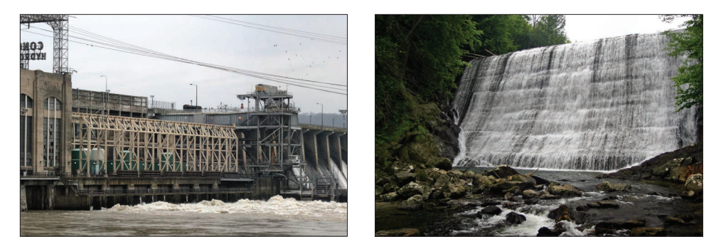
8.8—Anthropogenic dams, including hydroelectric facilities, flood-control reservoirs, and drinking water reservoirs, have negatively influenced the distribution and abundance of Wood Turtles range-wide by converting suitable, freeflowing stream habitat to deep reservoirs and starving downstream beaches through altered flow regimes. The total effect is difficult to estimate, but is clearly enormous. The Conowingo Dam on the Susquehanna River in Harford County, Maryland, is pictured at left. One of thousands of defunct New England dams—in this case, a 19<sup>th</sup>-century power dam—is pictured at right. MIKE JONES

Widespread stabilization projects occurred throughout New England and New York in the wake of Hurricane Irene (2011) and Tropical Storm Sandy (2012), many of which were implemented under emergency authorization (Murphy 2013). The effects of intensive stream stabilization on Wood Turtle habitat usage and suitability should be a priority for field evaluation.