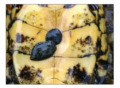
8.12—Wood Turtles are often parasitized by harmless leeches in the genus Placobdella . A relatively old adult male Wood Turtle is pictured from central New England. MIKE JONES

The influence of severe flooding on Wood Turtle habitat quality, reproduction, survivorship, and dispersal is complex. Flooding, a naturally occurring phenomenon in most Wood Turtle streams, may improve or degrade habitat quality based on extent,