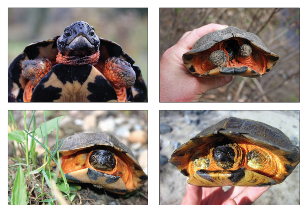
8.19—Adult Wood Turtles are sometimes found missing all or part of two limbs (often their front limbs). Under some circumstances these turtles can evidently survive for several years in the wild. The turtles pictured here from New England. MIKE JONES

their range: 9.7% in Michigan (Harding and Bloomer 1979); 16.8% in New Jersey (Farrell and Graham 1991), 32.3% and 15.2% at two sites in Québec (Saumure and Bider 1998), 48% at two populations in Massachusetts (Jones 2009), 43.5% of males and 5.5% of females in Vermont (Parren 2013) (8.18). Rarely, adults are found missing two limbs (8.19). Often though, the attack is lethal: three of 183 turtles radio-tracked by Jones (2009) were killed by mammalian predators, which represented 15.8% of the observed mortalities. Fourteen of the 36 mortalities observed on 141 transmitting Wood Turtles in the Midwestern U.S. were the result of predation, most thought to be Raccoon attacks (Lapin et al. 2019) (8.20).