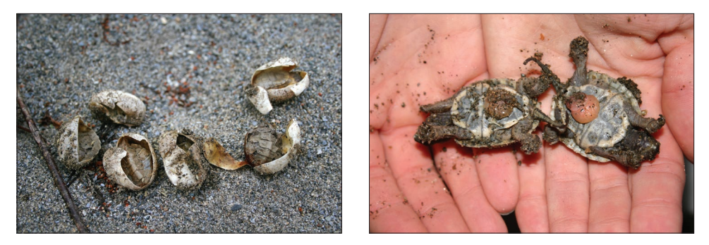
8.14—Severe flooding during the summer can directly result in nest failure if rising water inundates nesting areas for lengthy periods of time. Late-summer floods can result in complete nest failure by drowning hatchlings in the eggs ( left ) or cause young turtles to hatch and emerge prematurely from the nest ( right ). MIKE JONES

Flooding can also be a cause of nest failure, particularly mid-summer floods that over-wash sand bars, inundating low lying nests. While Wood Turtle eggs can sometimes survive flood events of several days (Vraniak and Geller 2017), late-season inundation can also prompt hatchlings to emerge prematurely from the nest (Jones 2009; Jones and Willey, unpubl. data) (8.14). Flooding is among the most important factors in the decline of Wood Turtle populations in Iowa, where Wood Turtles frequently nest on sandy stream banks and on riverbank sand bars below the high water line. Flooding has caused complete nest failure among known Iowa nests in 12 years out of approximately 15 years of monitoring (Tamplin, unpubl. data), and Spradling et al. (2010) reported 65% nest failure due to flooding from 2003–2006 in Butler County, Iowa.