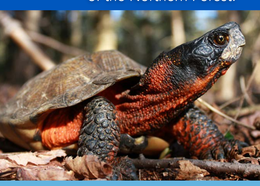
Leave Wood Turtles in the Wild.