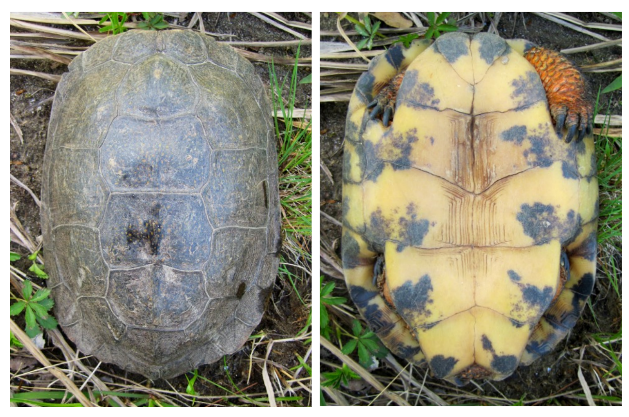
Figure 4. Standard-angle photographs of Male #37 from New Hampshire.

Mike Jones Massachusetts Division of Fisheries and Wildlife 1 Rabbit Hill Road Westborough, MA 01581 michael.t.jones@mass.gov (508) 389-7863