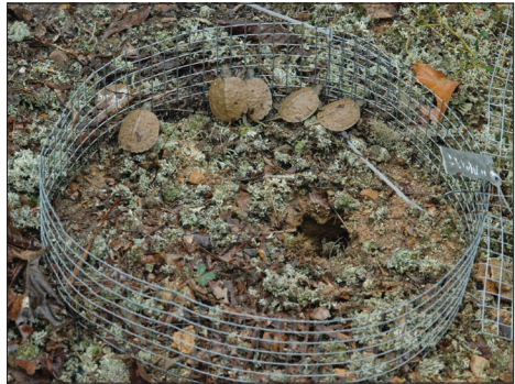
9.6—Several management strategies have been employed to reduce mammalian predation rates on turtle nests, including individual nest protection with enclosures. Here, a Virginia Wood Turtle nest protected by a hardware cloth enclosure is shown with the lid open. Generally, the use of nest enclosures is closely regulated by wildlife agencies because some designs can easily result in hatchling mortality. JOHN D. KLEOPFER