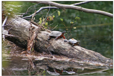
9.15—In addition to general instream habitat improvements associated with large wood, Wood Turtles likely benefit from the addition of large wood by actively bask on logjams and seeking shelter in the accumulated logjam. Basking Wood Turtles are pictured in northern New England. MIKE JONES