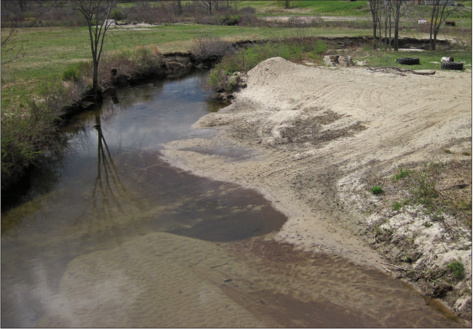
9.1—Wood Turtle populations may be classified along gradients of habitat impairment that should be considered when deciding where, how, and when to manage for the species. This site is heavily used by farm machinery. It is bordered on one side by a railroad line and on the other by a busy commuter road. MIKE JONES