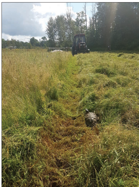
9.7—Research in New Brunswick, Québec, and Massachusetts indicates that sickle-bar mowers result in lower rates of expected Wood Turtle mortality when compared to disc and rotary mowers, but they are less efficient and have largely fallen out of use. Hayfield mowing is pictured at Wallace et al. (2020)'s research site in New Brunswick.