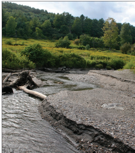
9.13—In some cases, dam removal provides opportunities to restore the natural flow of Wood Turtle rivers, returning the stream to a dynamic hydrological regime (top). However, some dams counter-intuitively provide habitat in their upstream delta channels, such as this site in New England (bottom). MIKE JONES