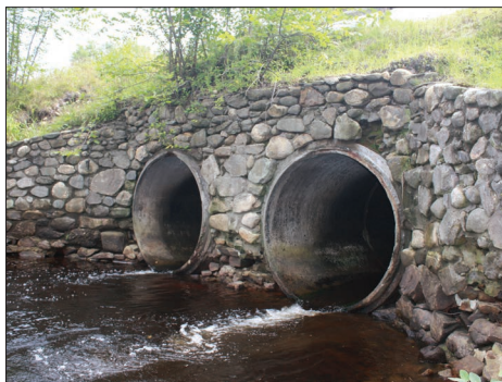
9.11—Perched culverts, such as these two sites in New England, interfere with instream Wood Turtle movements and appear to prompt turtles to move onto the roadway surface. Wood Turtles have been killed at these culvert crossings on several occasions. MIKE JONES