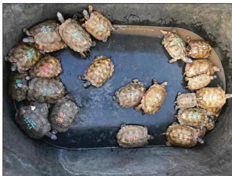
9.17—In cases where confiscated Wood Turtles appear to be of wild origin, they can be genotyped to their approximate watershed basin of origin and returned to the jurisdictional state wildlife agency to determine the best possible conservation outcome. MIKE JONES