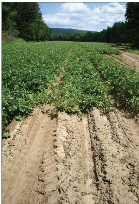
9.9—Row crop agriculture can result in Wood Turtle mortality depending on the harvest date and other machinery use during the season. Rotation of a given field from corn or potatoes to a late-season crop such as pumpkins could result in annual variation in Wood Turtle mortality rates. Two radio-equipped female Wood Turtles were killed in this Massachusetts potato field in midsummer. MIKE JONES