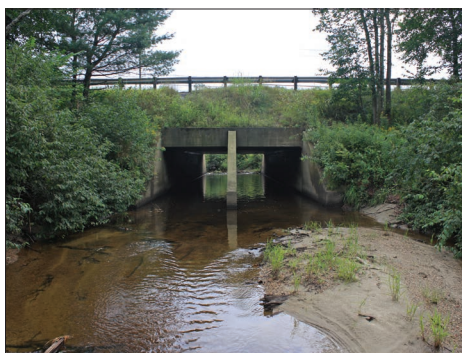
9.12—Full span bridges that approximate natural stream habitats, with high amounts of available light, will best accommodate Wood Turtle passage under roadways, such as this site in New England. MIKE JONES