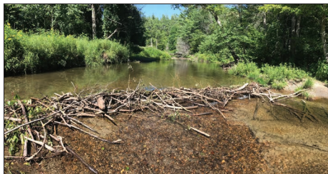
9.16—Anecdotally, Wood Turtles in Massachusetts seemed to avoid relatively large (0.5 ha) beaver impoundments, but elsewhere in New England Wood Turtles occasionally overwintered within small (<0.1 ha) beaver impoundments. The influence of beavers is probably net positive for Wood Turtles in large areas of continuous habitats, but may pose local management challenges where habitats have been severely fragmented. Here, a small beaver dam impedes a New England Wood Turtle stream.

Regrettably, it is also the case that Wood Turtles are confiscated from illegal trade networks with some regularity by state and federal law enforcement (see Chapter 8). In our experience, the origin of these turtles is often not immediately clear (Jones and Willey, unpubl. data; Weigel and Whitley 2018). Also from our experience, it is clear that the costs of handling large confiscations