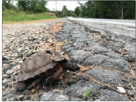
9.10—Roads near rivers occupied by Wood Turtles seem to be associated with increased probability of extinction of local Wood Turtle populations. This New England juvenile was killed on a state highway where the road parallels the suitable stream habitat for several kilometers—a long-term management challenge for this particular population.

Row Crop Harvest. —Many authors have noted that the potential for row crop agriculture to result in Wood Turtle mortality is partly a function of the harvest date (Saumure and Bider 1998; Castellano et al. 2008) (9.9). Late-season crop varieties that require harvest in fall (rather than summer) may result in lower risk to Wood Turtles because many turtles will have already returned to their overwintering habitat. For this reason, the annual rotation sequence of crops with different harvest schedules (e.g., corn vs. pumpkins) will influence mortality rates in unpredictable and complex ways. Castellano et al. (2008) recommended a harvest schedule that would minimize mortality to nests and hatchlings. In the Ontario system studied by Mullin et al. (2020), the watercourse was bordered by rotational crops of soy, corn, and hay (Mullin, unpubl. data). Of these crops, hay probably posed the greatest risk to the local Wood Turtle population because of its near-monthly harvest, while corn and soy were harvested relatively late in the season.