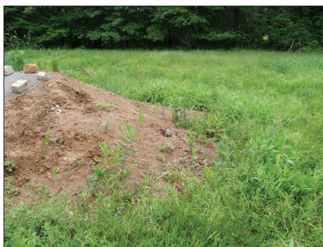
9.3—In some cases, especially in areas where natural nesting features are lacking, Wood Turtle nesting areas can be improved upon by depositing piles of sand and gravel, as pictured here in New Jersey.