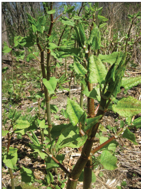
9.4—Instream features such as point bars, sand and gravel bars, beaches, and cutbanks can be improved by proactively attempting to eradicate invasive plant species such as Japanese Knotweed ( Reynoutria [Fallopia] japonica ), or clearing openings to allow nesting at sites where invasive species are already well established. MIKE JONES

Predator Deterrents and Control. —In landscapes that support exceptionally high densities of mammalian and avian predators, rates of predation on nests, hatchlings, and/or adult Wood Turtles are known to be unsustainably high (9.5). Several management strategies have been