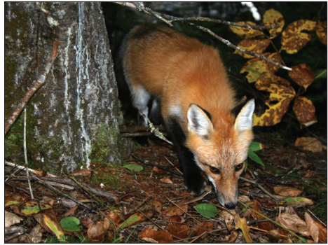
9.5—In landscapes that support high densities of mammalian predators such as Red Fox, rates of predation on nests, hatchlings, and/or adult Wood Turtles are known to be unsustainably high. MIKE JONES

employed across the species range to reduce mammalian predation rates on turtle nests. For example, individual Wood Turtle nests can be protected with a physical transparent structure such as hardware cloth or chicken wire to reduce mammalian predation rates, often by researchers attempting to measure demographic parameters such as clutch size (Compton 1999; Jones 2009) (9.6). These protective enclosures can cause hatchling mortality if not monitored daily beginning well prior to the expected emergence of hatchlings. These enclosures are generally only permitted to be installed in coordination with state or provincial wildlife agencies. More recently, larger-scale, electric fence enclosures have been utilized to surround entire nesting areas in order to exclude mammalian predators (Wisconsin: Lapin et al. 2015; Vraniak et al. 2017; Minnesota: Markle et al. 2019). Electric fences require substantial effort to set up, might attract unwanted attention by recreationists, and have proven to be only moderately effective in some locations for protecting nests of related turtle species. In their evaluation of a long-term headstarting program, Mullin et al. (2020) noted that predator control would likely result in greater positive impact on population growth rates than headstarting young turtles. The effectiveness of predator control on the nest-success rate of wild Wood Turtles has not been specifically tested, but should be targeted for future experimental research.