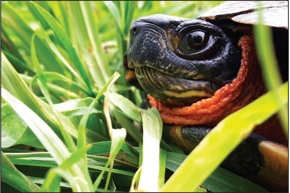
An adult Wood Turtle rests in a New Brunswick hayfield.