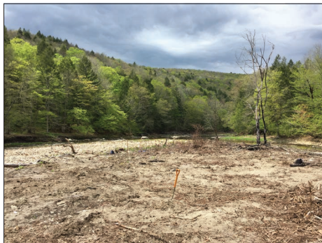
9.2—Nesting habitats often provide some of the clearest opportunities for management, ranging from light scarification to tree removal. Here, volunteers work to scarify plots within a concentrated Wood Turtle nesting area in Massachusetts.

the needs of the target population, as well as the broader landscape context, improper habitat management can undermine population recovery or even promote further population decline; and (2) effective restoration will require sustained support over time, and can require immense investment of monetary resources and human effort. If management actions are supported primarily with funds that would otherwise support landscape conservation at large scales (relative to the spatial needs of Wood Turtle populations), they can easily misdirect valuable conservation resources and undermine a larger vision for regional Wood Turtle conservation.