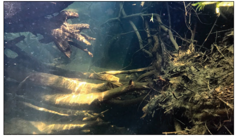
9.14—Large wood can diversify substrates, flow patterns, and habitats within the stream channel, and likely benefits Wood Turtles. The role of large wood in Wood Turtle streams warrants further research as a restoration technique. MIKE JONES