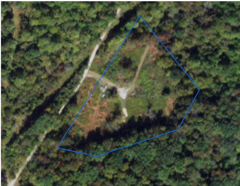
Figure 2. A feature polygon (blue) within a site.