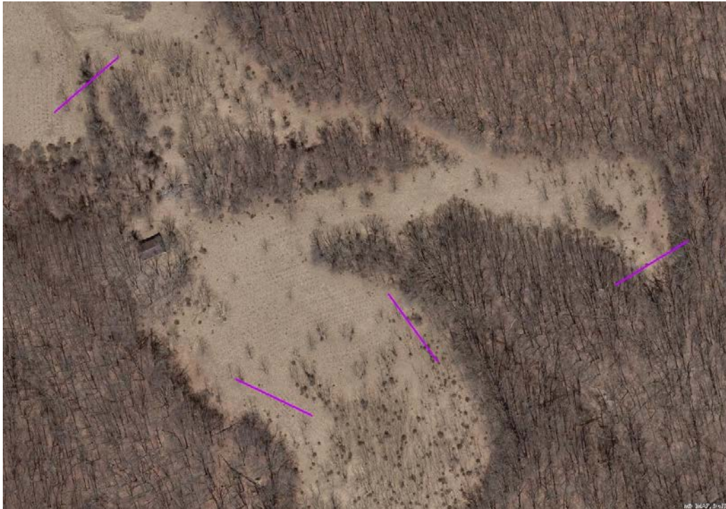
Figure 7. Four 56 m long drift fences set up at a site.