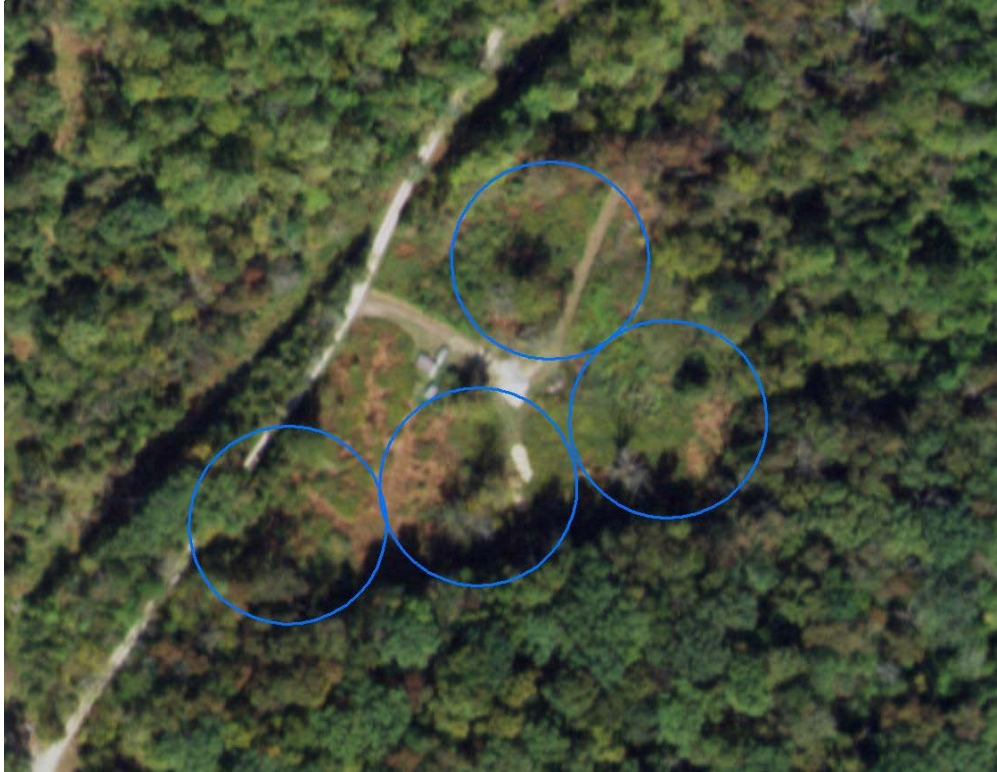
Figure 1. Four \frac{1}{4} ha sampling plots (blue) within suitable Eastern Box Turtle Habitat.