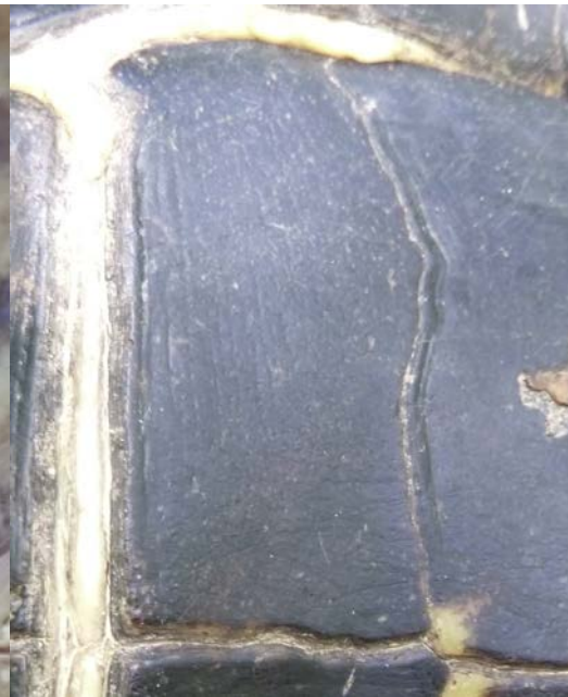
≥90% wear—growth rings not visible or only barely