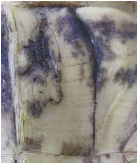
≥50% wear—many rings lightly visible