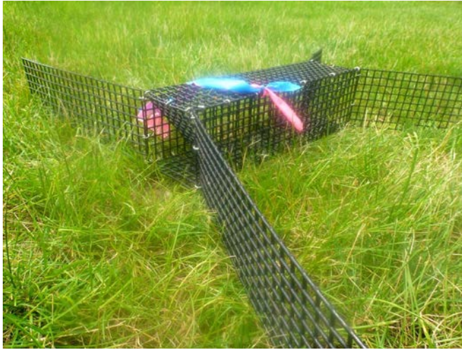
Figure 5. A photo of a passive box trap with adjustable wings.