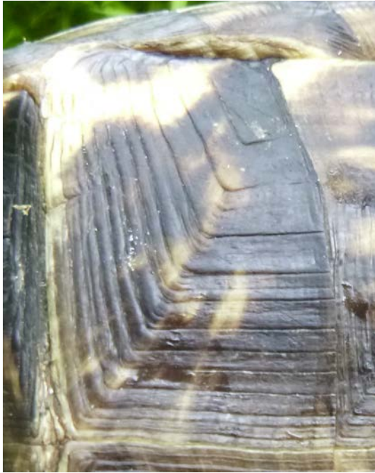
0% wear—distinct deep growth rings