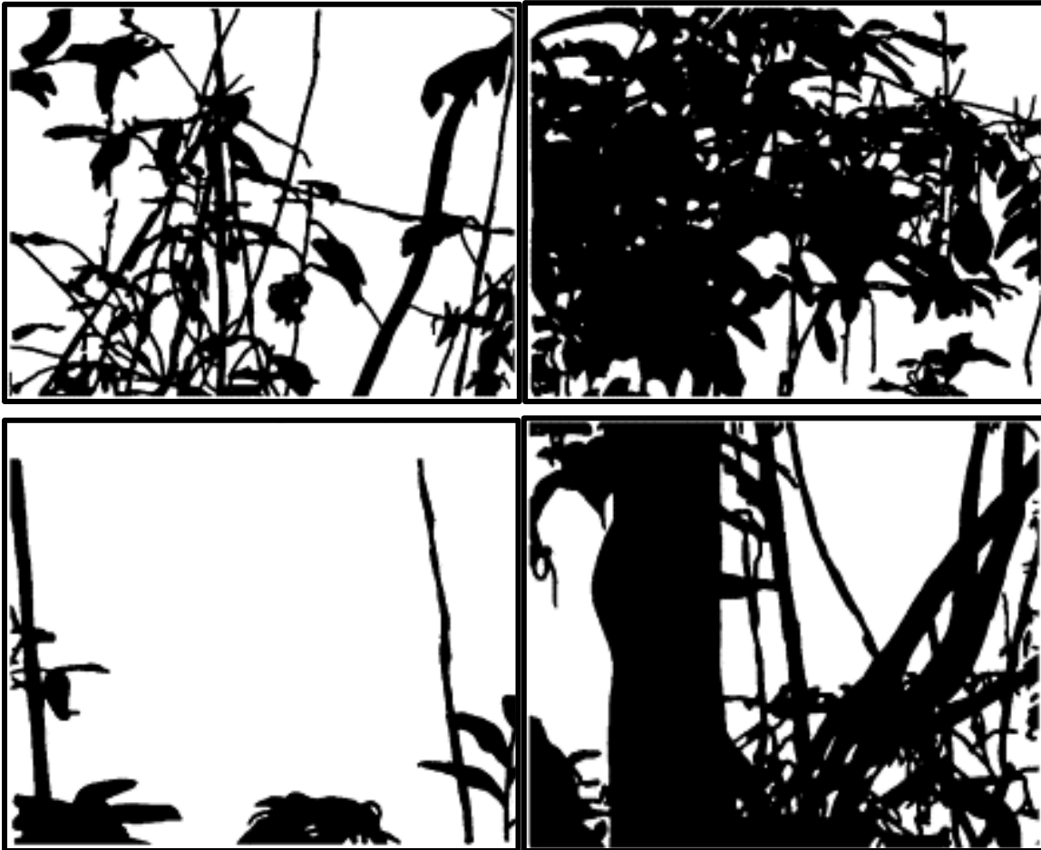
Figure 4. Graphics of thinly vegetated habitats on the left and thickly vegetated habitats on the right.