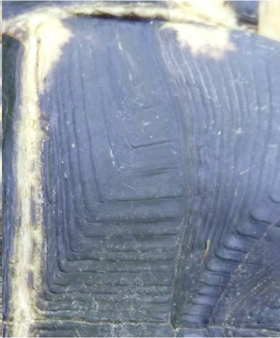
<50% wear—growth rings less distinct but most visible