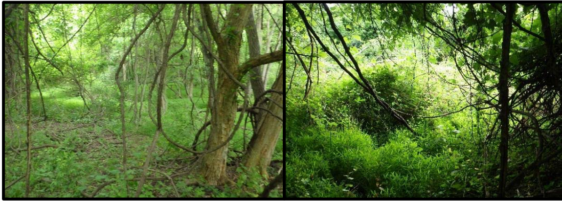
Figure 3. Image of a thinly or regularly vegetated habitat on the left and thickly vegetated habitat on the right.